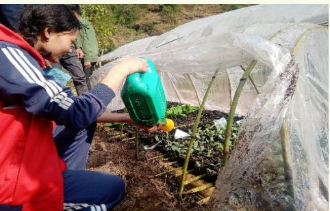
Agricultural education in Ghyangfedi

In February 2021, Adara organized a series of workshops for 45 female students in Ghyangfedi between Years 5-10 on the topics of puberty and menstrual hygiene. They were pleased to hear that the girls are increasingly becoming more confident in attending school whilst on their periods and are always able to access menstrual hygiene products when they ask. Toilet blocks and running water at each school is greatly improving the ability of these students to practice sound menstrual hygiene management. To further support young girls in the region, Adara's health programme manager distributed sanitary pads and other dignified menstruation resources in March to more than 160 female students in Humla. As these products were distributed, girls were also taught about personal hygiene and how to wash their garments properly.