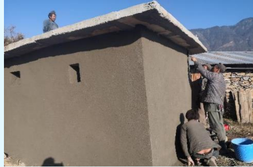
New toilets at the Nava Sikchya Niketan school