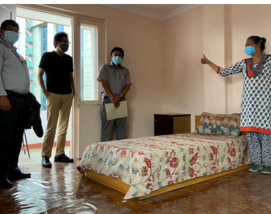
Nurses' accommodation in Kathmandu