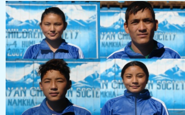
SEE Graduates from the Yalbang School