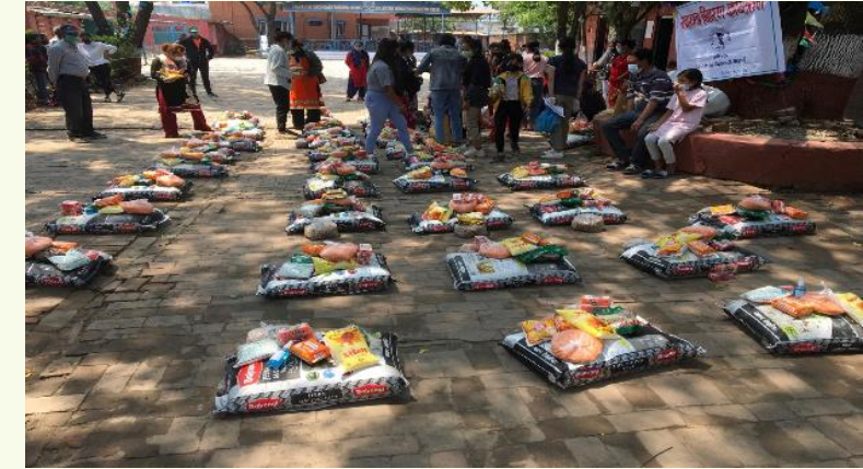
Emergency food support for 215 vulnerable families, distributed by HIO

Adara's partnership with the Women's Foundation has been vital throughout Nepal's second wave of COVID-19. WF has received an unusually high volume of calls and emails from women seeking counselling and legal support for domestic violence situations. Courts have been closed in Nepal due to the lockdown, however WF has still been able to support 89 women through mediation and counselling, which were conducted via telephone calls during lockdown.