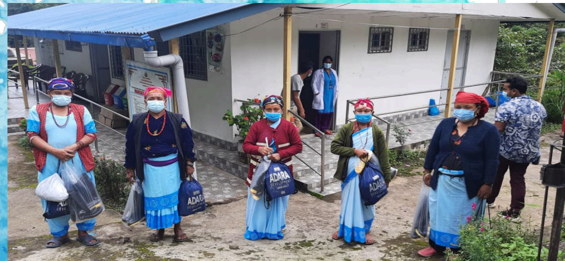
Female community health volunteers in Ghyangfedi