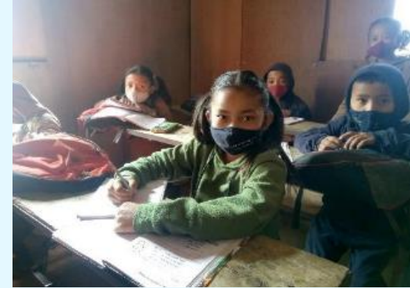
Schools were regularly supplied with PPE

As student engagement and academic results continue to improve, so does the learning environment and school infrastructure in Humla. Earlier this year, Adara utilised the period of school closures to complete some improvements to the toilet blocks in the Chauganfaya School. When the Kholsi School completes some minor repairs to their toilet blocks later this year, all Adara-supported schools in Humla will have separate, well-functioning toilets for boys and girls – which is vital to maintaining the high attendance of female students.