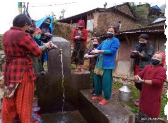
FCHV's session on hand washing