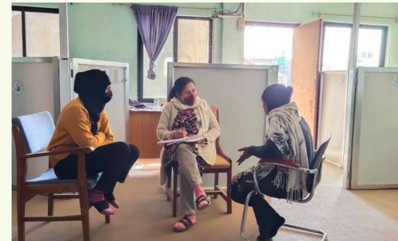
Counselling services provided by the Women's Foundation