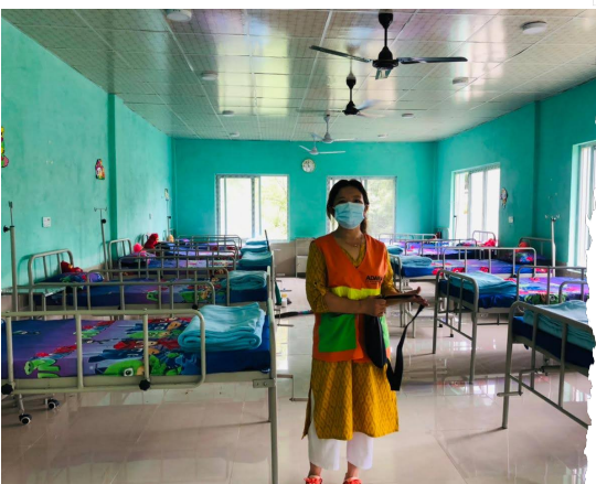
Children's ward in Ghyangfedi

With your support, Adara's teams have worked tirelessly this year to support the already vulnerable communities in Nepal throughout the second wave.