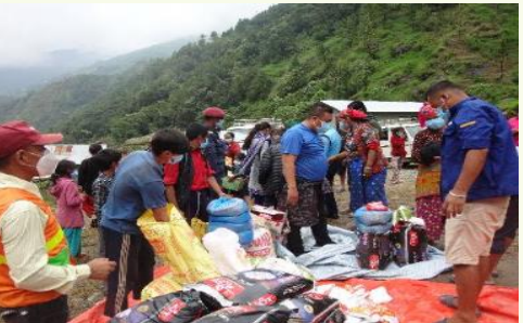
Emergency food basket support to landslide victims of Ghyangfedi