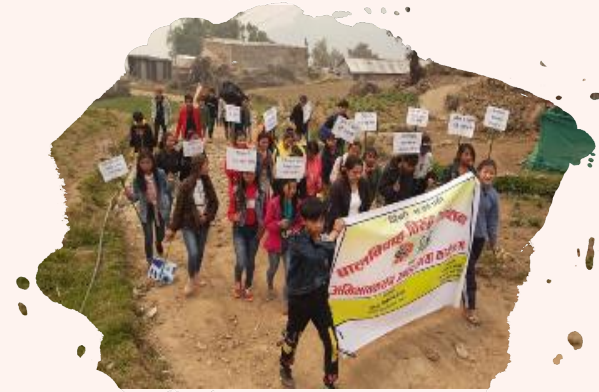
Child Club moving to new villages for a drama performance