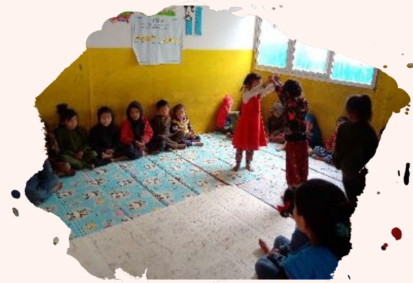
Performance of Child Club drama

In December 2020, two young girls were trafficked from Ghyangfedi. Thankfully, Nepali police found them in the hands of traffickers on the Nepal-India border and the culprits have been charged with trafficking. The girls have been safely returned to their villages, and Adara is supporting them to re-enrol in school, and providing them with additional skill-based training. There were no reported incidents of child trafficking from Humla in the last six months.