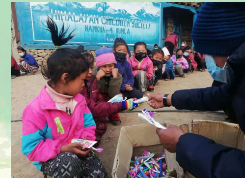
Children receiving toothbrushes and toothpaste at the Yalbang School